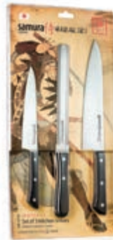
SHR-0230B SET OF THREE KNIVES SHR-0023B, SHR-0057B, SHR-0085B