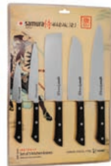
SHR-0250B SET OF FIVE KNIVES SHR-0011B, SHR-0023B, SHR-0043B, SHR-0085B, SHR-0095B