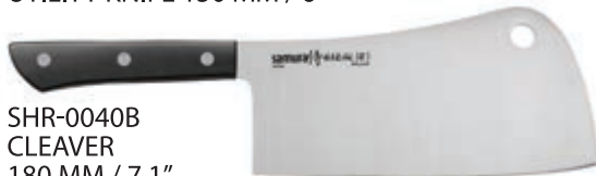
SHR-0040B CLEAVER 180 MM / 7.1"