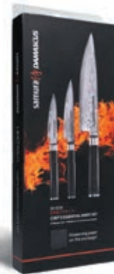
SD-0230 SET OF THREE KNIVES SD-0010, SD-0021, SD-0085

The steel blade continues through the handle offering a full tang knife providing the ultimate in balance and quality. 67 layers of Damascus steel deliver strength, sharpness and function.